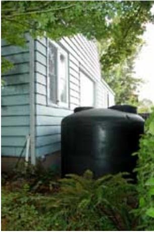
Example of a Residential cistern