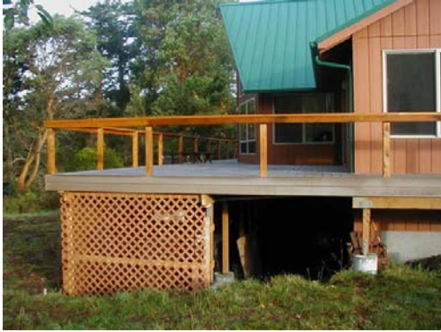
Cistern underneath deck of home in San Juan County