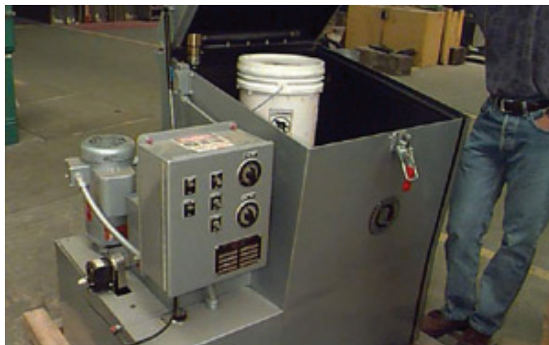
Aqueous Parts Washer

The design of a water-efficient shop depends to some extent upon the type of service offered. New air-quality regulations have also meant that shops have switched from solvent-based parts- and brake-cleaning systems to aqueous-based systems. Floor-cleaning with dry methods, preventing spills and leaks from entering the wastewater discharge system, and the proper design of oil separators have as much