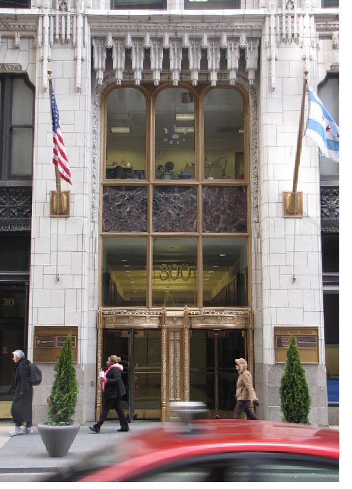
Home of the Alliance for Water Efficiency at the historic 300 W. Adams Building in Chicago