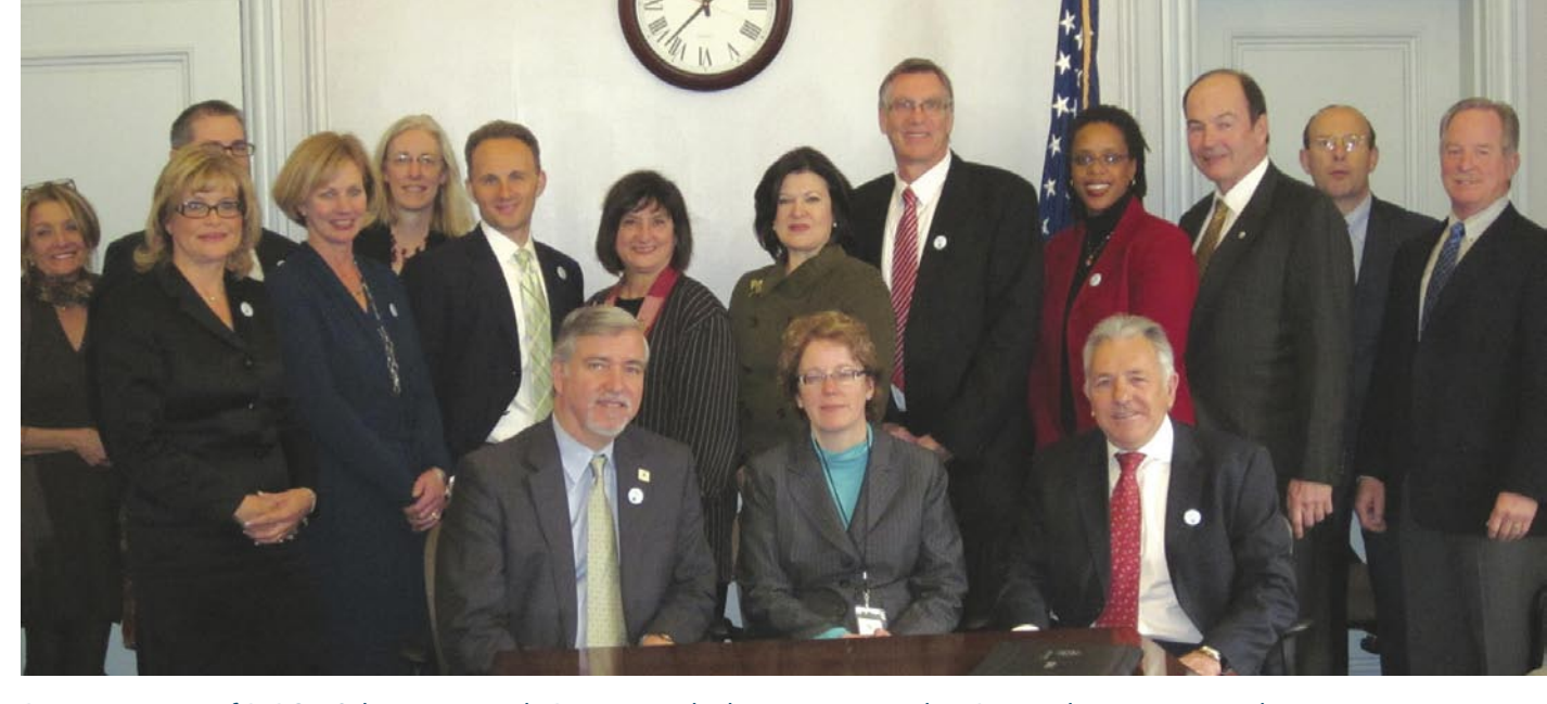
Representatives of PERC, ASFlow, AWE, and EPA signing the historic MoU at the EPA Headquarters in Washington.