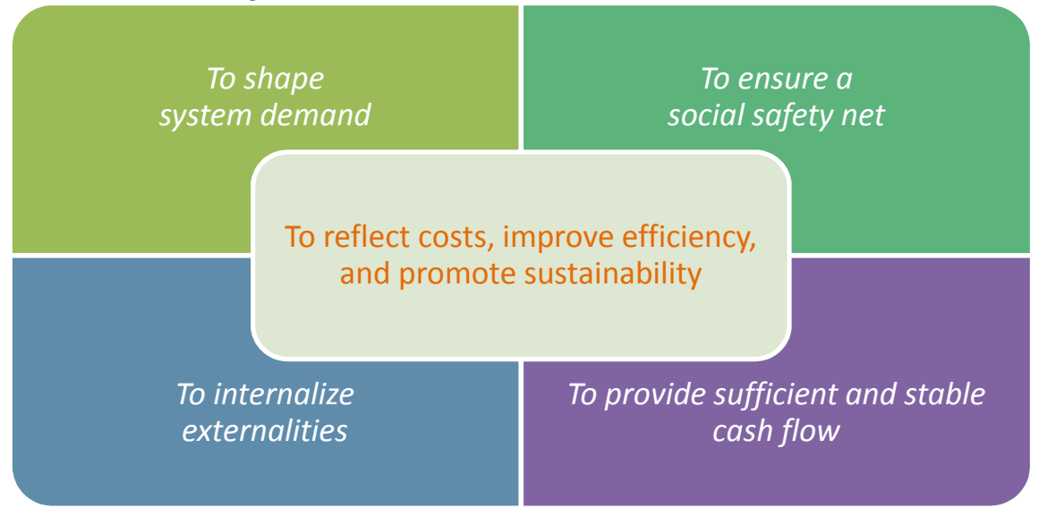
Exhibit 3. Water Pricing Goals