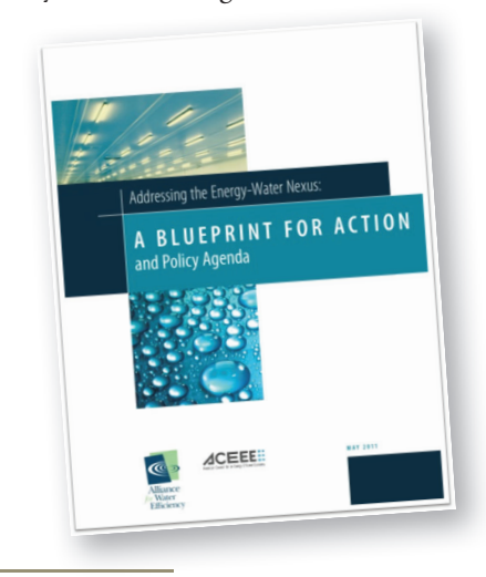
5 "AWE-ACEEE Water and Energy Research Work Group." Alliance for Water Efficiency. n.d. Web. 25 Apr 2013. <a href="https://www.allianceforwaterefficiency.org/Water-Energy-Research-Group.aspx">http://www.allianceforwaterefficiency.org/Water-Energy-Research-Group.aspx</a>>.

The AWE-ACEEE Water and Energy Research Work Group (Work Group) meetings consisted of presentations and discussions that help to promote, track, and understand water and energy research. The Work Group is made up of representatives from all sides of the water-energy nexus: water utilities; power utilities; public works and county agencies; universities and other private and public research groups; local, state, federal, and international agencies; climate and resource advocate groups; industry and consulting firms.